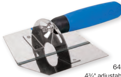
640010 4¾" adjustable corner trowel

The square and angle tool is produced from stainless steel and is for setting accurate corners around windows, frames and reveals