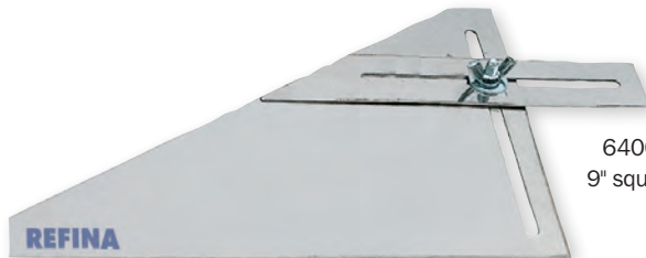
640006 9" squangle