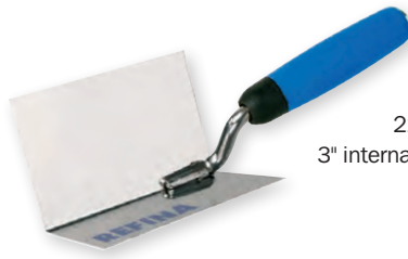
227308 3" internal corner trowel