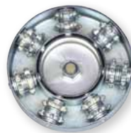
348146 C6 cutters