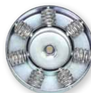
348284 C4 cutters