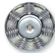
348506 C5 cutters