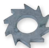
C4 solid tungsten cutters