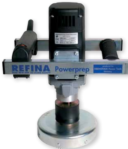
EPO180H-SRX6 surface scabblers