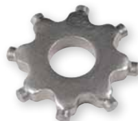
C6 tungsten tipped cutters