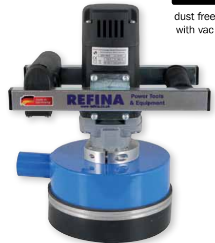
356560F dustex hood