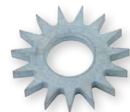
C5 solid tungsten cutters