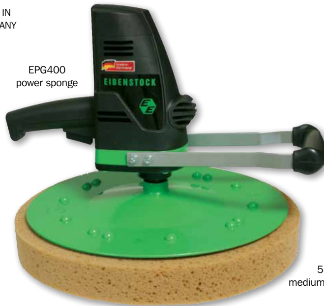
EPG400 power sponge