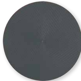
550417 float disc