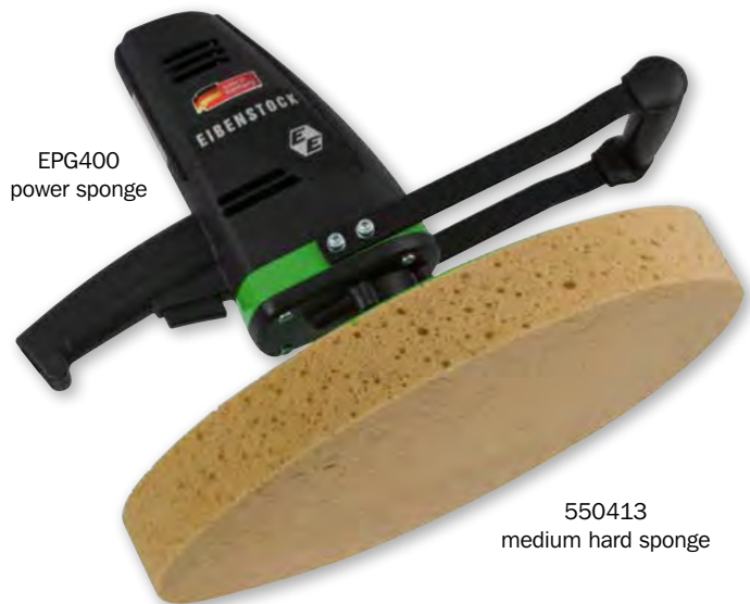
EPG400 power sponge