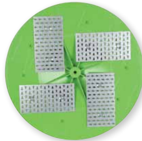
550419 toothed scraper disc