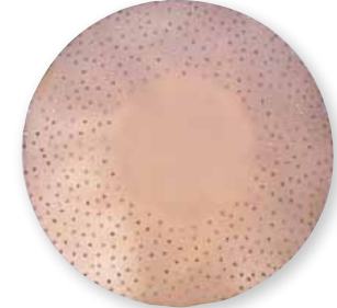
315344 tungsten carbide disc