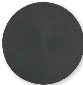
550417 float disc