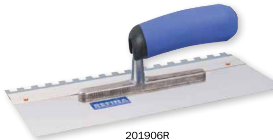
201906R 11" notched slotted trowel

They have a slotted edge to take the full range of serrated blades