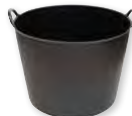
320004 40 ltr trug