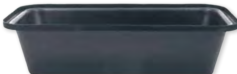
321601 160 ltr mixing bath