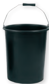
323001 30 ltr mixing tub