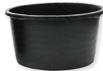
326502 65 ltr mixing tub