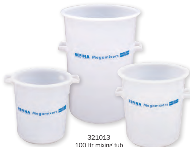
321010 35 ltr mixing tub