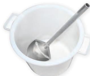
35 ltr mixing tub & Mack bucket scoop