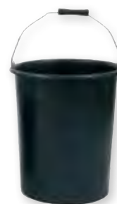
323001 30 ltr mixing tub

The trug is produced from a flexible plastic compound which is easy to clean and to remove old plaster and cement from