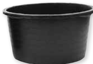
326502 65 ltr mixing tub