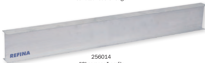
256014 4'0" scraper I profile