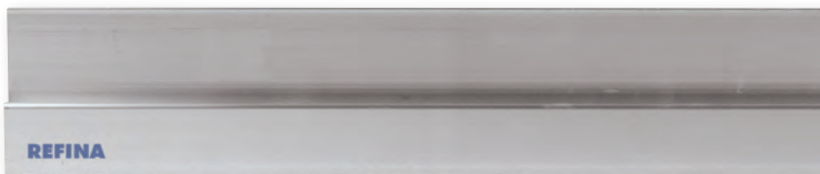
253520 h section feather edge