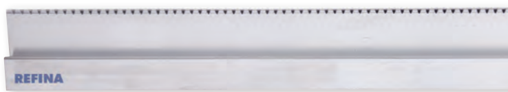
253540 serrated feather edge