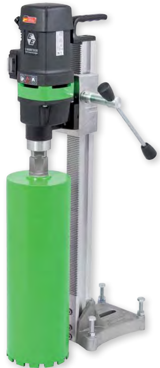
DB160 drill & rig