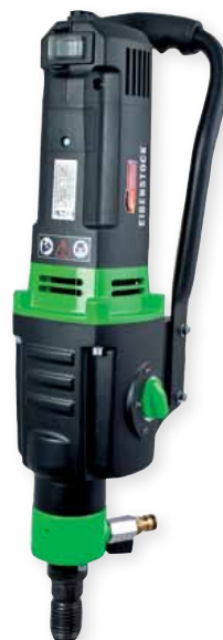
EBM352/3 diamond drill