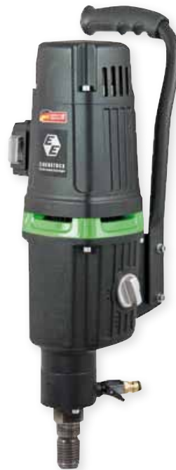
PLD450 diamond drill