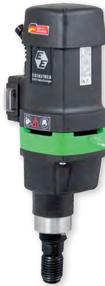
EBM160 diamond drill