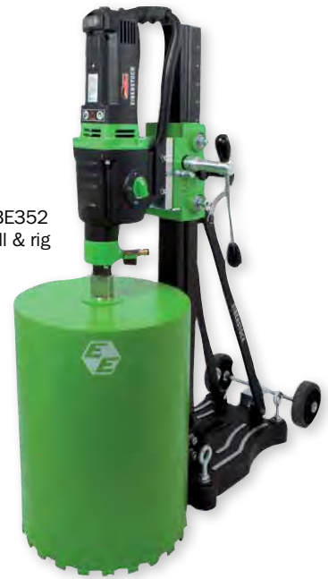
DBE352 drill & rig