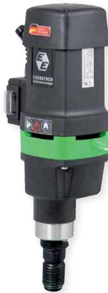
EBM160 diamond drill