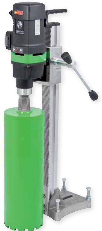
DB160 drill & rig