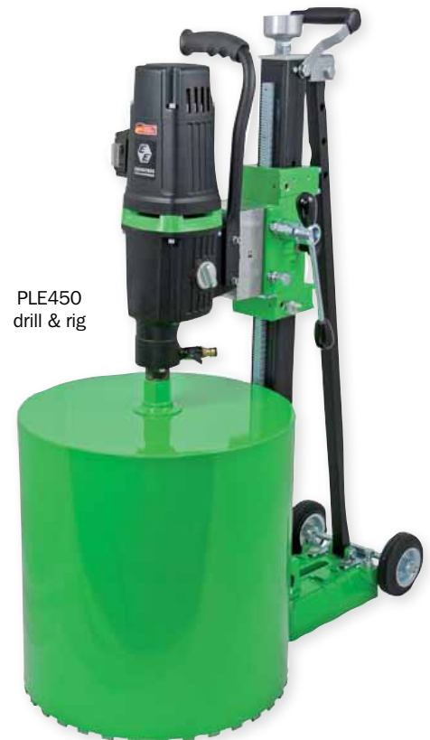
PLE450 drill & rig