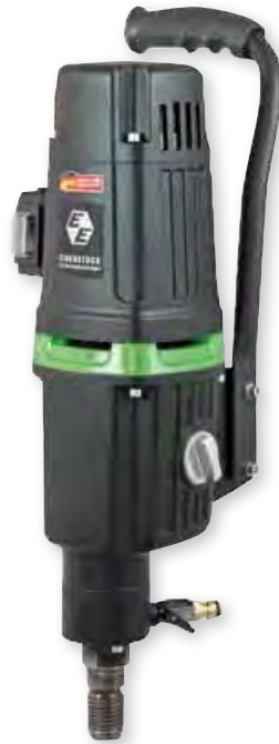
PLD450 diamond drill