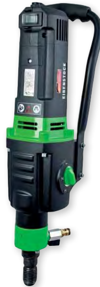
EBM352/3 diamond drill