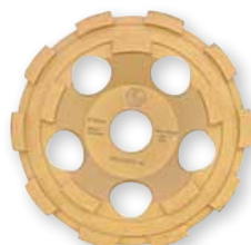
315125 DX5-G15 disc