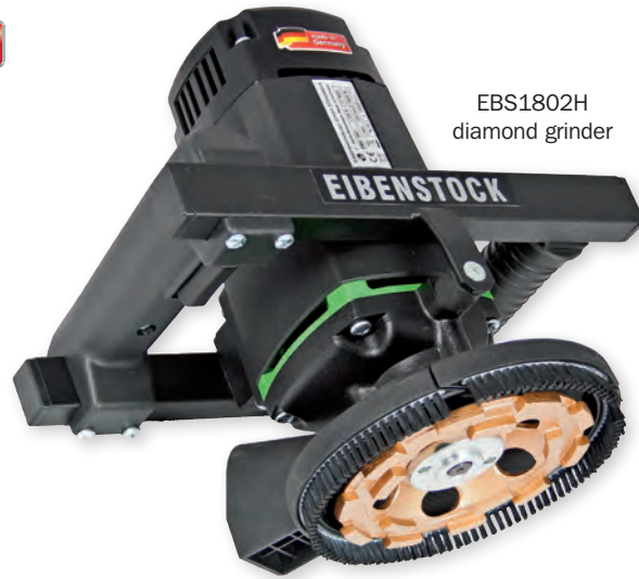
EBS1802H diamond grinder