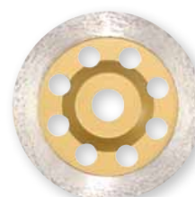
315194 DX5-MC disc