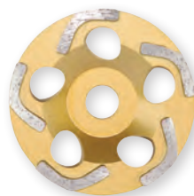
315200 DX5-H5 disc