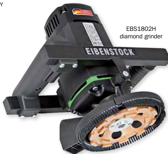
EBS1802H diamond grinder