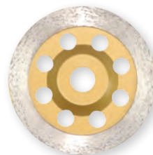
315194 DX5-MC disc