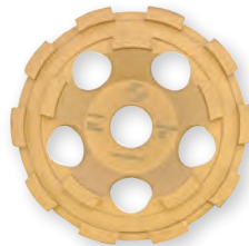
315125 DX5-G15 disc