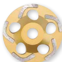
315200 DX5-H5 disc